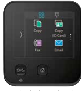
2.8-inch colour touch panel