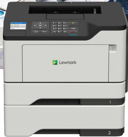
MS521dn with optional trays